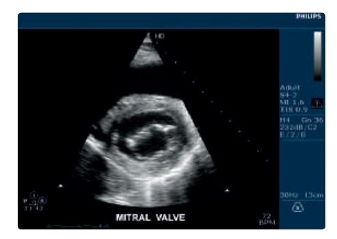
The S4-2 sector array transducer supports cardiac exams as shown in this two-chamber view of the mitral valve.