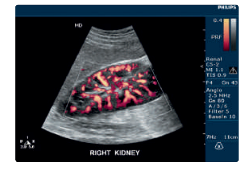
Color Power Angio imaging and the C5-2 curved array transducer enable full appreciation of blood flow within the vessels of the kidney.

Color flow imaging with the L12-3 linear array transducer enables assessment of vasculature in superficial imaging, as shown in this thyroid.