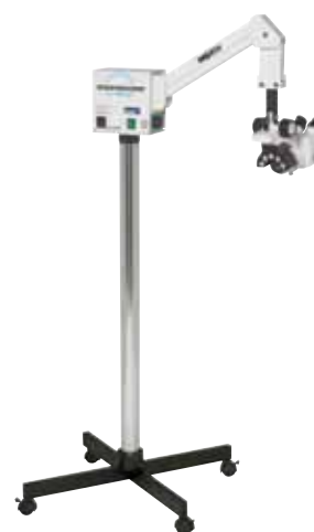
ZoomScope™ with Trulight™

Δ Available for Sale Where CE Mark is Required † Available for Sale in Canada