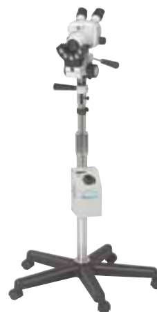
ZoomStar™ with Trulight™