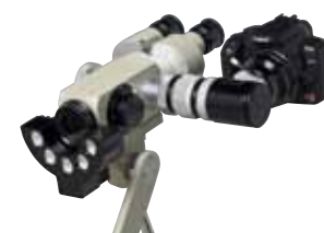
Digital SLR Camera and Adapter