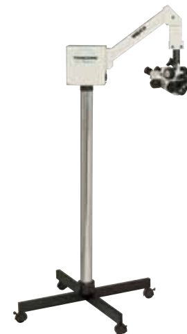
TriScope™ with Trulight™