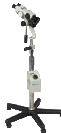
TriStar™ with Trulight™