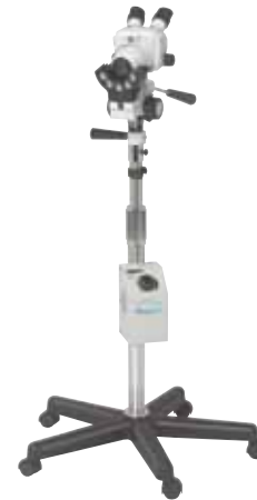
ZoomStar™ with Trulight™