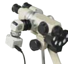
Digital USB Video Camera and Adapter