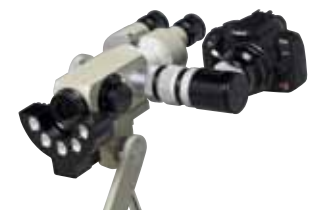
Digital SLR Camera and Adapter