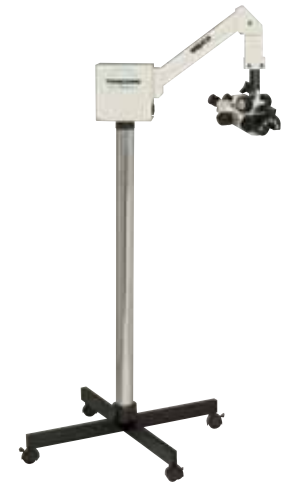
TriScope™ with Trulight™