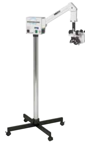
ZoomScope™ with Trulight™