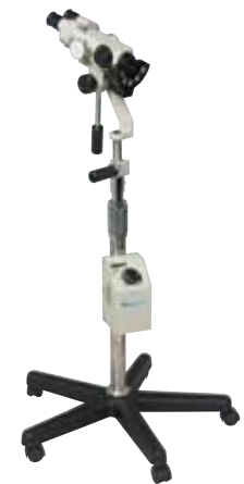
TriStar™ with Trulight™