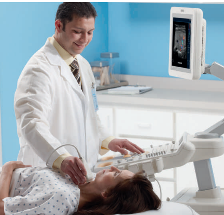
Linear array transducers on the HD7 XE system provide superb access and image quality for superficial scanning, such as the thyroid.

The Philips HD7 XE system offers Philips best-in-class high definition performance. You get excellent image quality born of our more advanced systems plus the design and breadth of applications available for demanding use in cardiovascular, Ob/Gyn, anesthesiology, women's health, oncology, electrophysiology, stress echo, pediatrics, orthopedics, urology, emergency, and other applications.