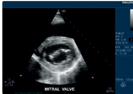
The S4-2 sector array transducer supports cardiac exams as shown in this two-chamber view of the mitral valve.