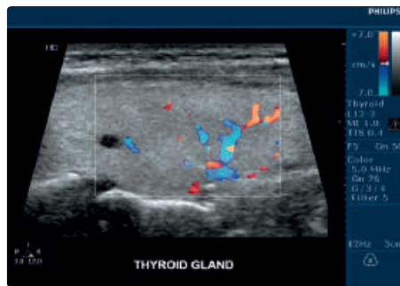
Color flow imaging with the L12-3 linear array transducer enables assessment of vasculature in superficial imaging, as shown in this thyroid.