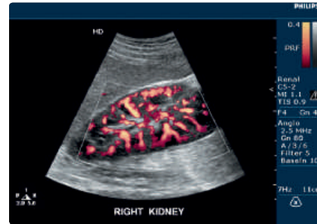
Color Power Angio imaging and the C5-2 curved array transducer enable full appreciation of blood flow within the vessels of the kidney.