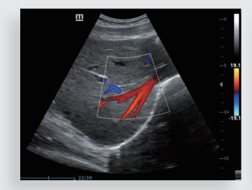
Color Flow of Liver

With powerful user-defined presets, auto image optimization, iWorks (scan protocol), and patient information management system, the Z60 Ultrasound System makes it fast and easy to complete exams. The System also provides onboard reporting and DICOM 3.0 which greatly improves your workflow without compromising diagnostic accuracy.